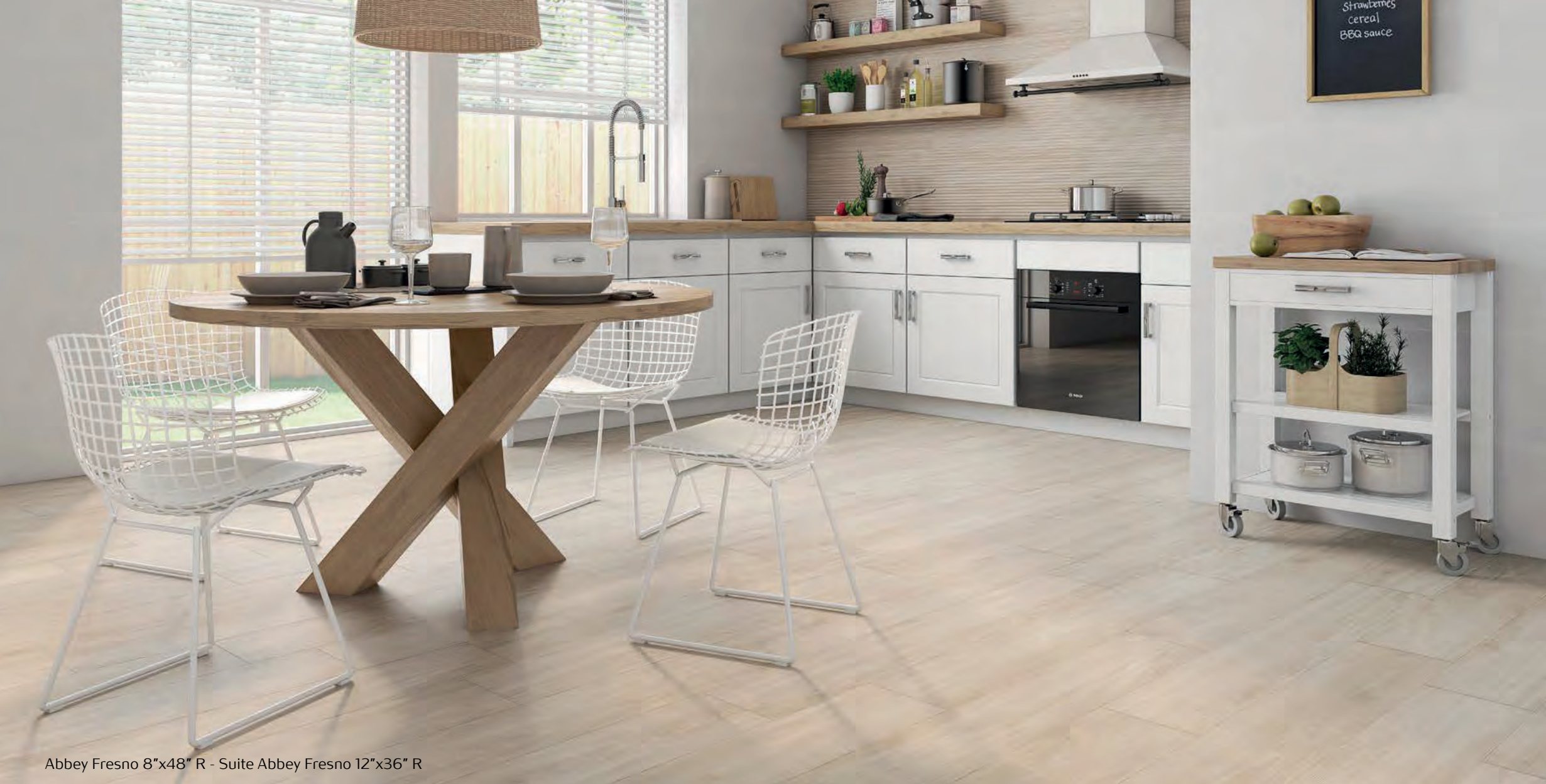
Abbey Fresno 8"x48" R - Suite Abbey Fresno 12"x36" R

This Glazed Porcelain floor tile unfolds in traditional colors and shades: Fresno, Roble, Vison, and Gris. A high quality porcelain proposal with a natural or antislip finish for outdoor or water areas.