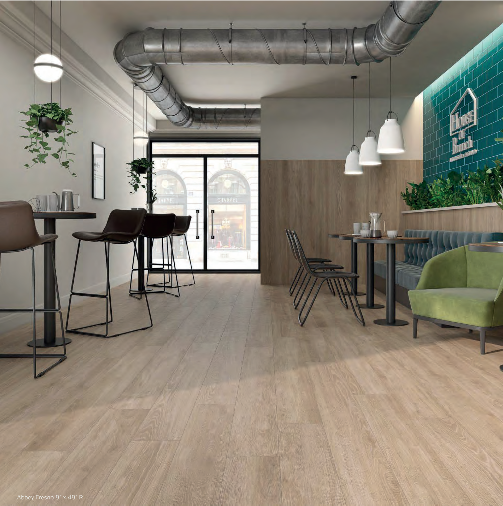
Abbey Fresno 8" x 48" R

The Abbey collection will give any interior the warm charm of untreated wood. A simple, unadorned floor that expresses its naturalness in long planks playing tribute to rustic floors.