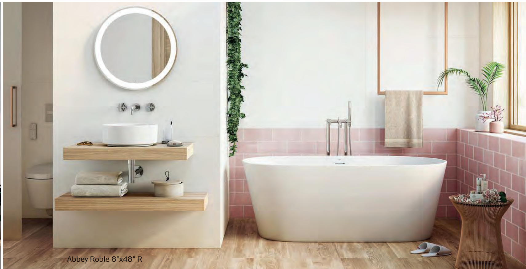
Abbey Roble 8"x48" R